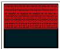
Power cycled 3 times without proper log in.

When the computer is powered with the PC Moderator installed, the screen will show a flashing blue or red FULL screen that gets smaller toward the top. Do not type on the keyboard during this time. Wait until the Login Prompt appears. If resuming from system standby with flashing blue screen, pressing <Scroll Lock> twice will skip to Login Prompt.