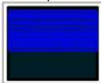
Normal Power Up